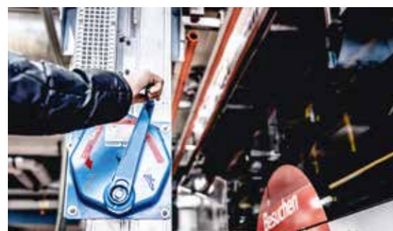
The work platforms can be mechanically widened on both sides

GÜNZBURGER STEIGTECHNIK was convincing once again in Regensburg thanks to its expertise as an experienced equipment and project planner. This is because the design was optimally adapted to the individual requirements and local conditions. The gantry roof working platform stands above a pit workstation and consists of two individual platforms with railing frames. These can be moved together parallel to the vehicle via a fixed rail guide, which prevents any collisions with the bus.