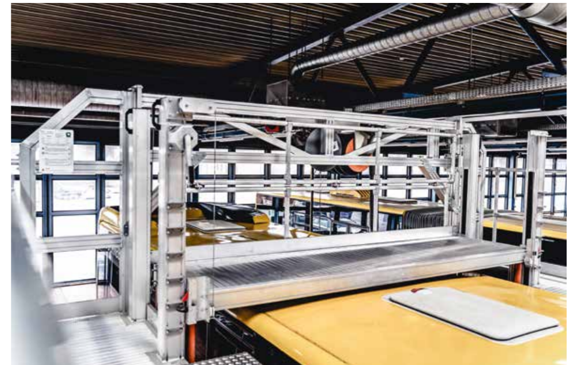
The height of the front work platform can also be adjusted. It serves both as a bridging step and as a work surface