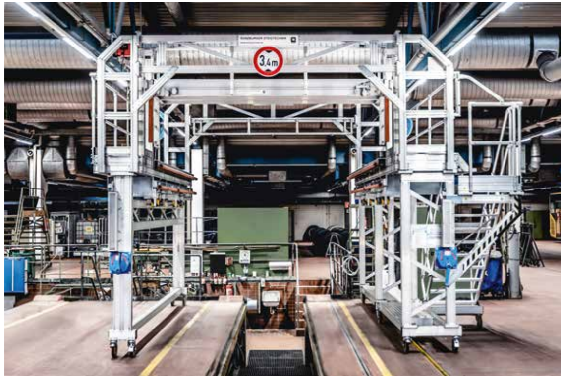
Whether in the pit or on the roof: the maintenance team can do all the work needed at just one maintenance workstation