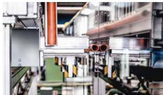
The work platforms can dock to the vehicles with zero clearance