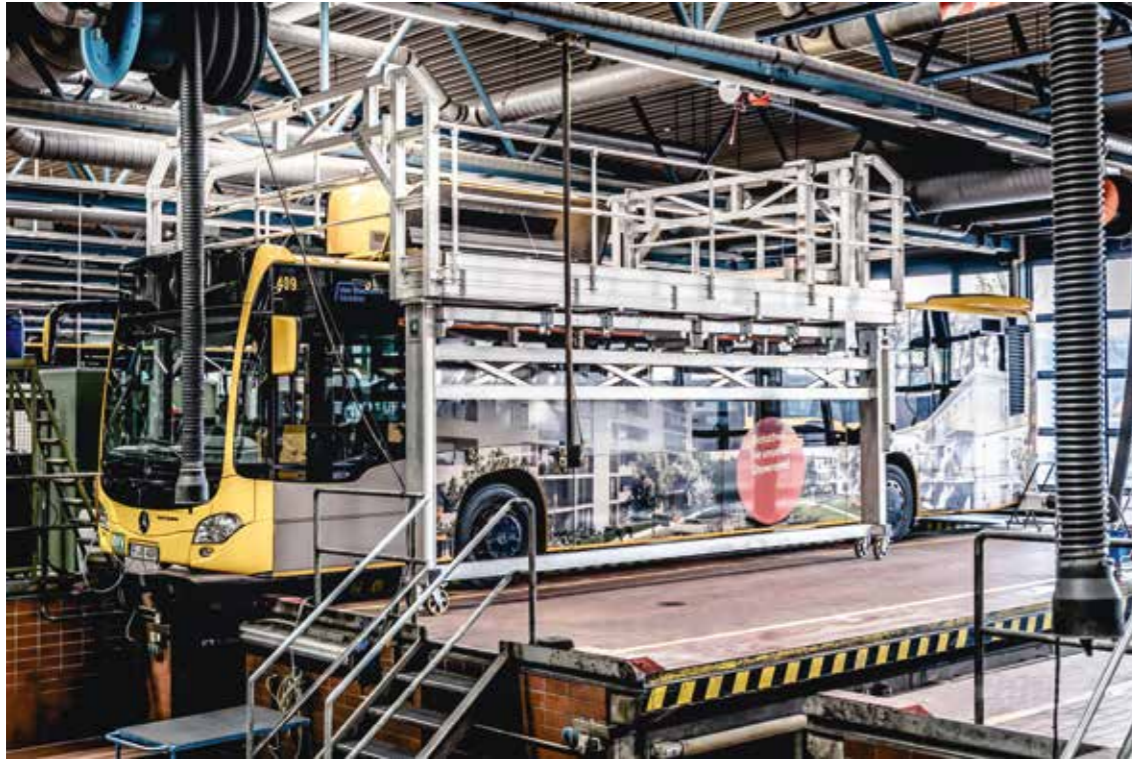
The mobile gantry roof working platform from GÜNZBURGER STEIGTECHNIK offers work safety and efficiency.