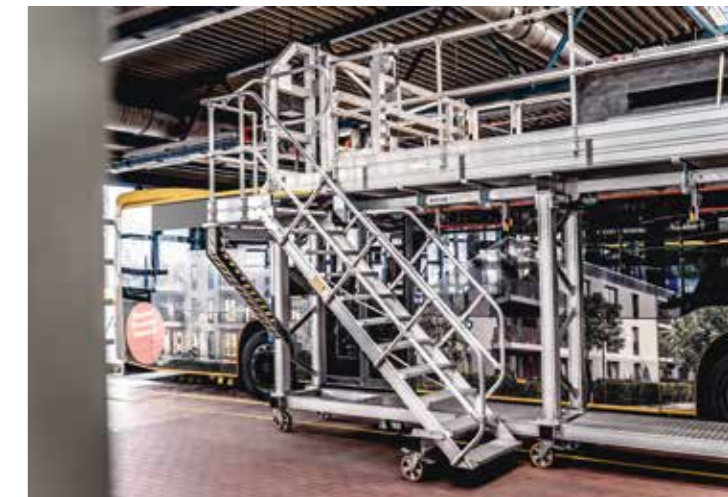
Access to the roof working platform is via stairs on the side with handrail and railing as well as a self-closing safety door.

In Regensburg, up to two people usually work on the roof working platform at the same time to maintain, repair or replace batteries, control units or air conditioning systems, for example. The engineers can perform maintenance on up to three vehicles per day – depending on the actual work that needs to be done. Whether articulated buses with conventional propulsion or the somewhat smaller electric midi-buses used in Regensburg's narrow old town: the vehicles can drive directly under the gantry roof working platform and, depending on the type of vehicle, the working area can be adapted to the needs at the time. Additional mechanically extendable platforms were installed on both sides on a lower level especially for the maintenance of the new electric bus fleet.