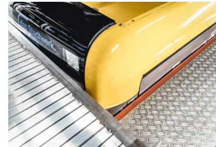
The work platforms on each side have an aluminium surface with a slip resistance of rating group R 9 and can be docked to the buses with zero clearance

Discover the many benefits of a roof working platform in the video at www.steigtechnik.de/portalbuehne