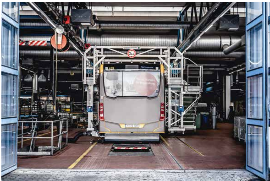
The mobile roof working platform is designed as a gantry platform so that the buses can drive all the way in